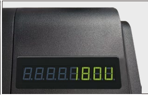
Large Character LED Display for Operator