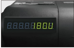
Large Character LED Display for Customer